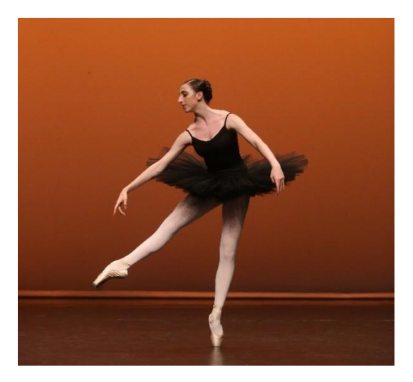
Solo Seal finale

There is also a separate Discovering Repertoire specification which extracts key information about this new provision in a standalone document so that it is easily accessible.